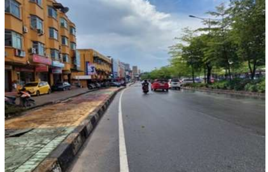
Figure 3. Road Traffic Conditions in Nagoya

What is meant by effectiveness of utilization is the extent to which the infrastructure being built is utilized, the greater the use of infrastructure by the community, the higher the effectiveness of utilization. The level of utilization of road infrastructure in the Nagoya trade and services area is very high considering that this area is a mobility destination and is the center of trade and services in Batam City. This indicates that the effectiveness of utilization related to the provision of road infrastructure is quite good.