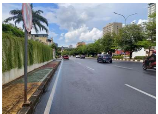
Figure 2. Road Availability Conditions in Nagoya