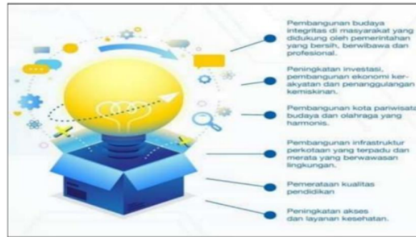
Figure 2. Palembang City Development Priorities

The Palembang City Government in 2021 has described the development priorities of Palembang City and one of these development priorities is the harmonious development of tourism, culture and sports cities as seen in figure 2 below: