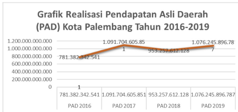
Figure 1. Graph of Regional Original Revenue Realization (PAD) Palembang City Year 2016-2019

The government remains consistent in fully supporting the development of sports tourism that elevates regional culture in the development of an OPI Jakabaring lake tourist area, and the government continues to strive to make Palembang City sports tourism contribute to increasing the Regional Original Income (PAD) of Palembang City, along with the table of Palembang City PAD for 2016-2019.