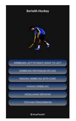
Figure 4. Main view of the application