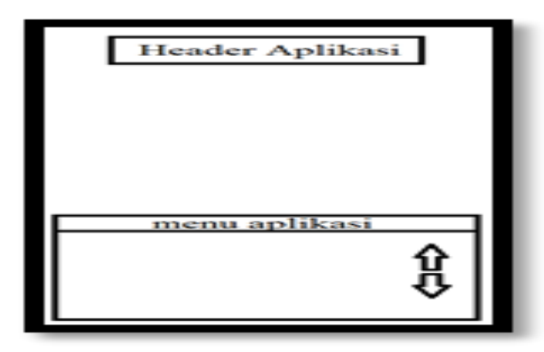
Figure 1. Application Flow Design

The initial stage is carried out by conducting a literature study followed by factual field studies. A literature study was conducted to examine theories regarding dribbling hockey exercises and the creation of android applications and other supporting devices. Field factual studies are used to see the progress of the dribbling exercise process being carried out. At this stage, the researcher designs an android application that will be made with the application flow which can be seen in Figure 1.