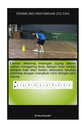
Figure 6. Display of the 2nd content page