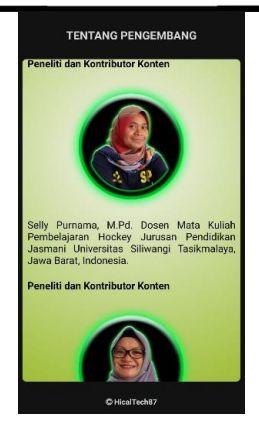
Figure 10. Display of the 6th content page

email jurnal: jurnalhon@univpgri-palembang.ac.id situs web: http://www.univpgri-palembang.ac.id