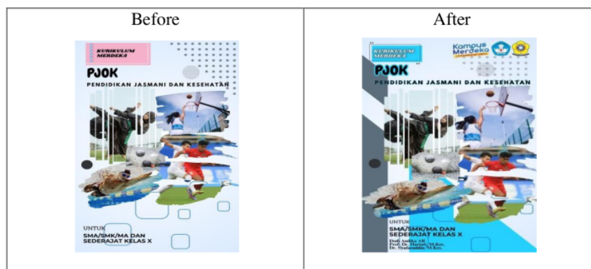
Figure 2. Book before and after revision

Based on the results of the main trial, the total score obtained was 3.60, this score shows that the textbook is in the very positive category and is suitable for use as teaching material in PJOK subjects in class X vocational schools. However, there is still a remaining questionnaire answer score of 0.40, which shows that there are still several shortcomings in making digital-based textbooks. Therefore, researchers will revise the textbook to improve its quality.