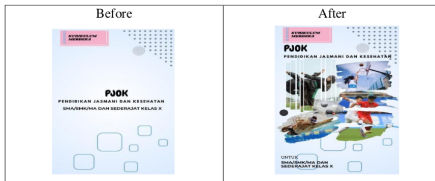
Figure 1. Book before and after revision

Then the researchers conducted a main trial involving 70 Class X students at SMK Negeri 1 Palembang. Researchers asked respondents to provide responses to questions on the research instrument related to the level of practicality of digital-based Physical Education Textbooks. From the results of the main trial of the PJOK Subject Textbook by 70 Class X students at SMK Negeri 1 Palembang.