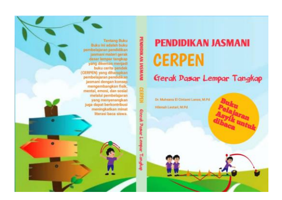
Figure 1. Book Cover

In this regard, physical education learning must also contribute to improving student reading literacy. For this reason, the basic movement learning of the catch throw is packaged into a short story book (short story).