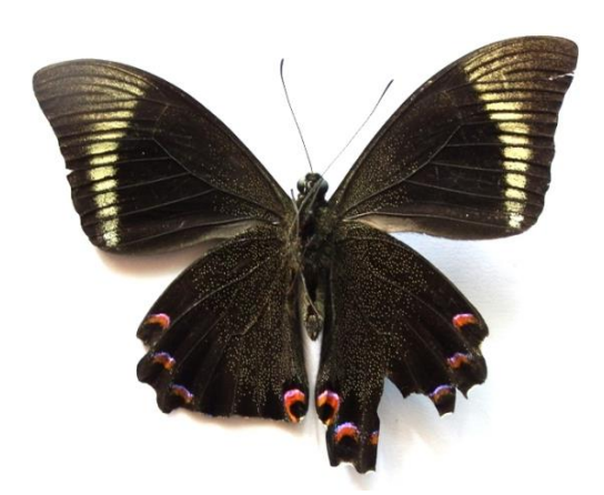
Figure 2. Ventral view of male P. paris dempo collected in Mount Dempo, 5 February 2020.

Since described in 1988 as a new subspecies, record of P. paris dempo are none. Our finding of P. paris dempo in 5 February 2020 is a rediscovery for this butterfly after 32 years break (1988 to 2020). The P. paris dempo has very tiny distribution area, restricted in remaining forest around Dempo mountain. Introduce beautiful butterfly this to local stakeholders is need to support its conservation efforts. Papilio paris is not listed as a threatened butterfly by IUCN (The International Union for Conservation of Nature) redlist criteria because this species has wide range distribution. However, at the subspecies level, P. paris dempo has very small range area, presumed this subspecies become fragile. We propose, in the regional level, the P. paris dempo should be protected; and nationally, the status should be listed as Endangered.