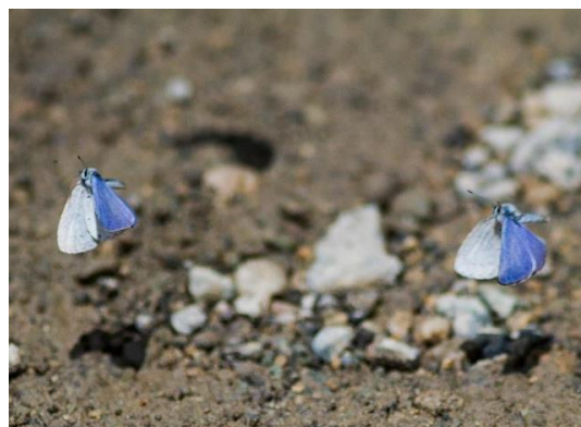
Figure 1. Two U. dilecta neodilecta found in Lake Kaco, Jambi Province, 18 August 2014.

species is very similar to Udara rona and Udara cardia . The two tiny pale butterflies from Lake Kaco of Jambi Province is eliminated from U. cardia by lacking darker spots in hindwing beneath; and unconsidered as U. rona because U. rona has a darker blue colour on upperside wings (Eliot & Kawazoe, 1983; Corbet & Pendlebury, 1992; Parsons, 1999; Schroeder 2020).