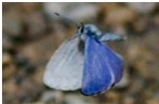
Figure 2. Close up of U. dilecta neodilecta found in Lake Kaco, Jambi Province, 18 August 2014.

There are seven subspecies of U. dilecta : U. dilecta coalitoides (Rothschild, 1915), U. dilecta dilecta (Moore, 1879), U. dilecta neodilecta (Corbet, 1937), U. dilecta paracatius (Fruhstorfer, 1917), U. dilecta parva Eliot and Kawazoé, 1983, U. dilecta subcoalita (Rothschild, 1915) dan U. dilecta thoria (Fruhstorfer, 1910). U. d. catius (Fruhstorfer, 1910) and U. rona rona (Grose-Smith, 1894) (Eliot &